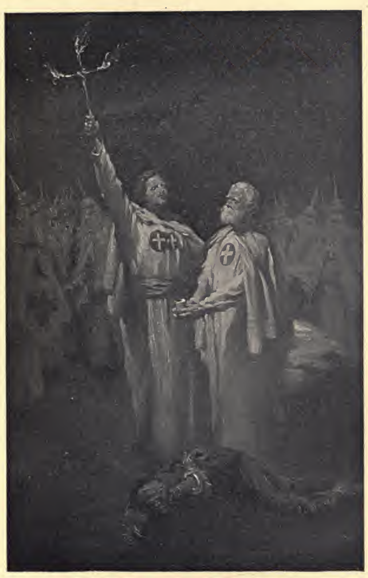
"The Fiery Cross of old Scotland's hills!"